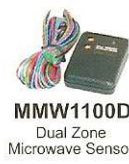
MMW1100D Dual Zone Microwave Sensor