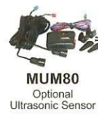
MUM80 Optional Ultrasonic Sensor